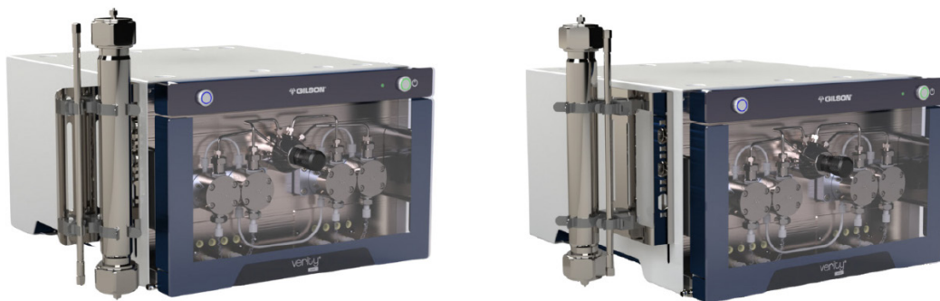
Figure 2 Column Holder Facing the User (Left) and to the Side of the Pump (Right)