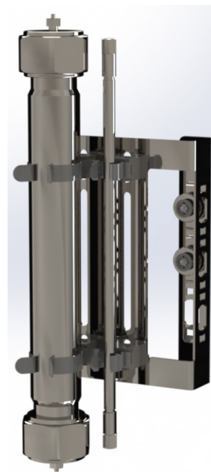
Figure 1 Column Holder with Two Columns

Two locking devices are provided to attach the holder to the integrated accessories rail of the pump.